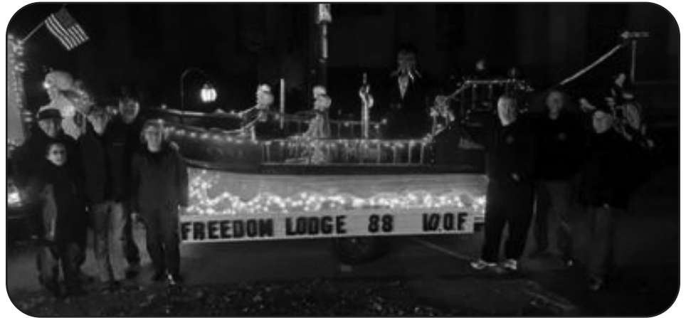
Members of Freedom Lodge No 88 got together and participated in the Honesdale Halloween Parade. It was great seeing all the smiling faces on the kids.